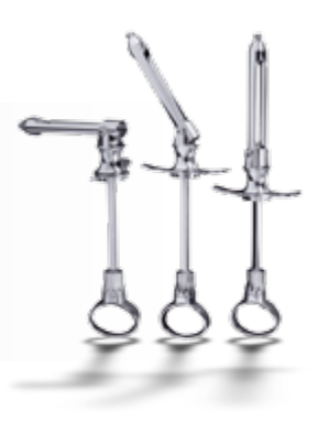
Code: 76012 -1 syringe/box